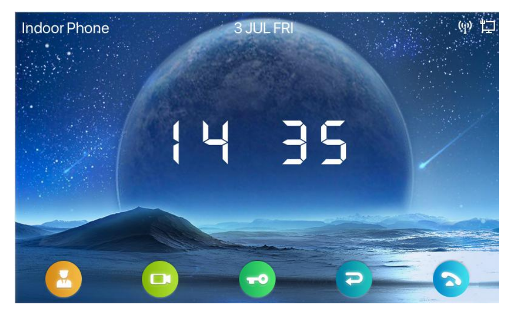
Picture2 – Idle Screen

The figure above shows the default standby screen, which is what the user interface looks like most of the time.